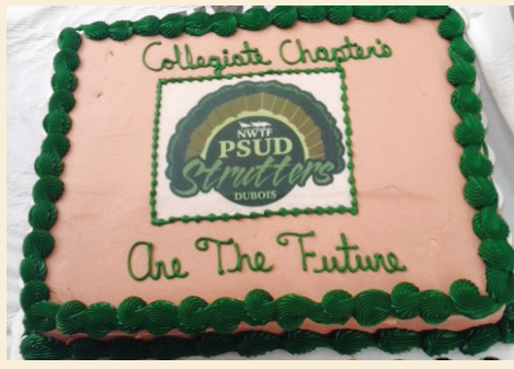
The Penn State DuBois Strutters chapter of the National Wild Turkey Federation celebrated their first fundraising event at Bilger's Rocks in Grampian on September 13.