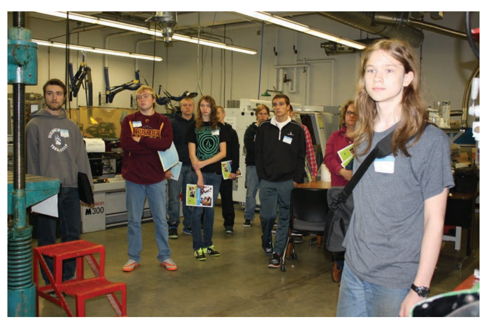
Students touring the Penn State DuBois engineering labs.

Manufacturing Day is a national event supported by a group of industry sponsors and co-producers. Events were held at more than 2,000 locations across the country, intended to addresses common misperceptions about manufacturing by giving manufacturers and educational institutions an opportunity to open their doors and show, in a coordinated effort, what manufacturing is.