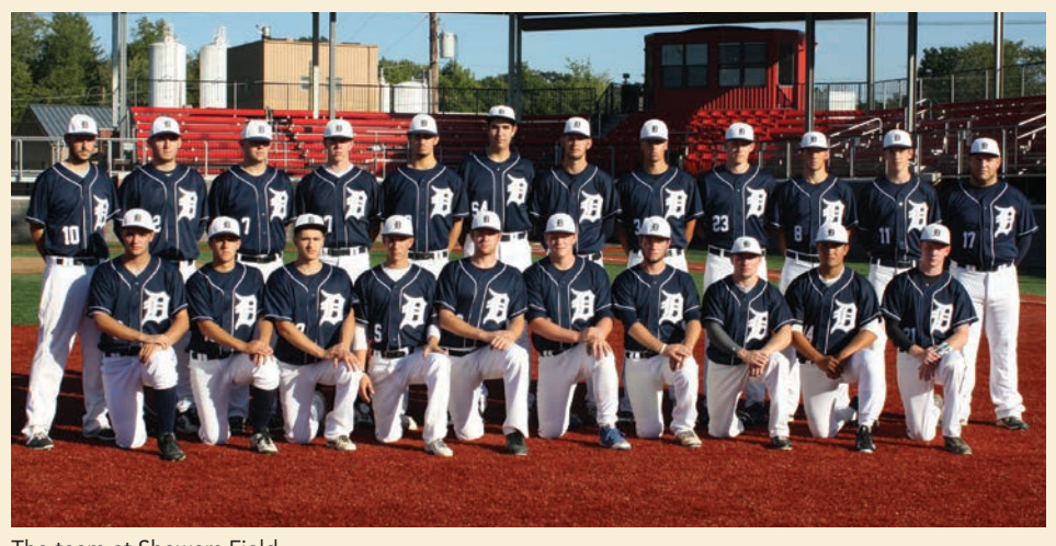
The team at Showers Field.

The Penn State DuBois Nittany Lions kickoff their spring baseball season at Houghton on March 12. Their first home appearance is a double header set for 1:00 p.m. on March 19, as they play host to Keuka at Showers Field in DuBois. A full schedule and the latest updates on the team is available at http://www.psuduboisathletics.com