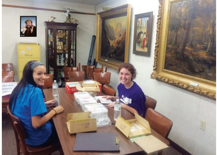
Students serving at various community sites during outreach day.