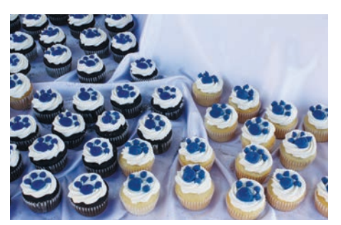
Cupcakes for everyone!