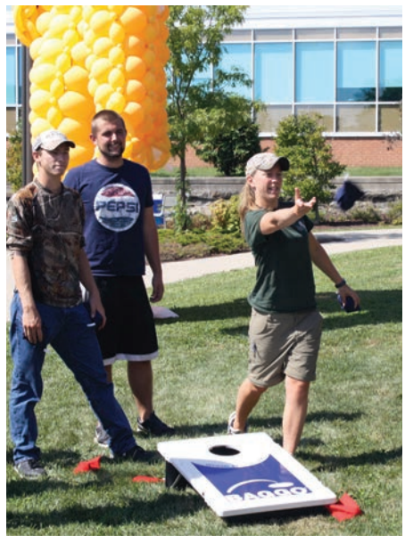
Corn hole and other games kept students, as well as faculty and staff entertained.