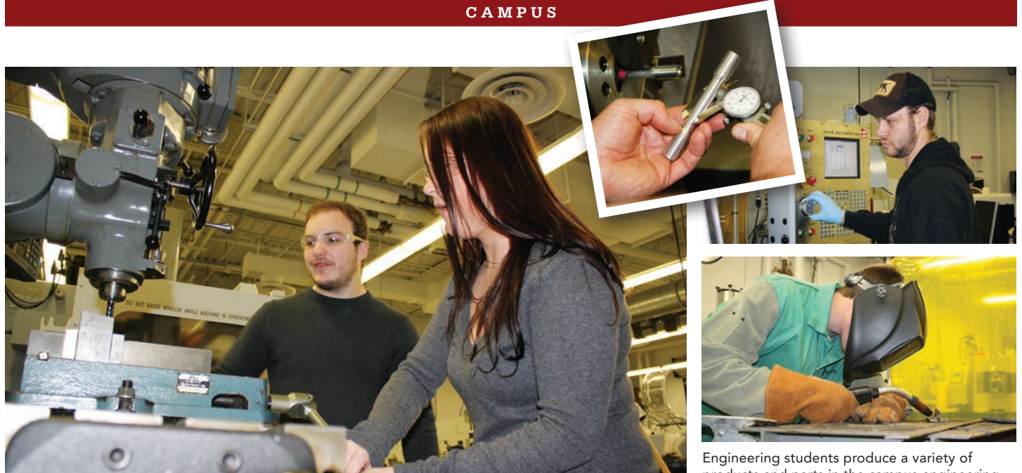
products and parts in the campus engineering labs, many that simulate the process professionals use to manufacture parts for the automotive industry, home appliances, and more.