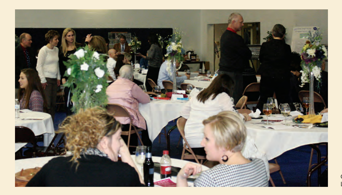
Guests mingle at the Seventh Annual Lion Wine and Cheese.