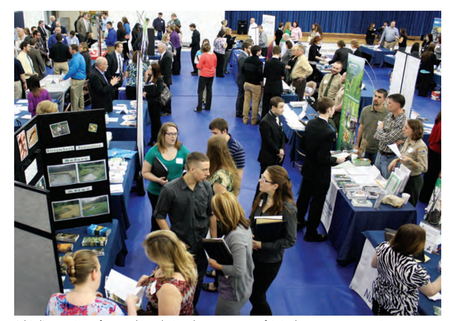
A bird's eye view of networking during the open career fair in the campus gymnasium.